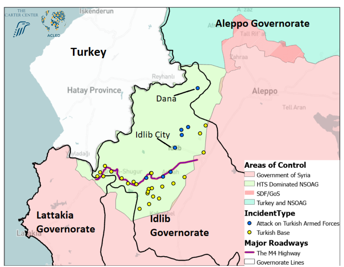
Figure 2: Turkish military bases and attacks against Turkish armed forces in Idlib Governorate since 5 March 2020. Data from The Carter Center and ACLED.